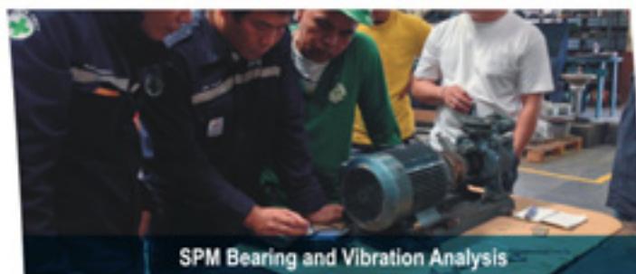
SPM Bearing and Vibration Analysis