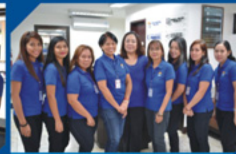
Office of the EVP - Finance & Admin