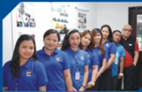
Office of the President