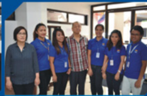
Office of the EVP & COO