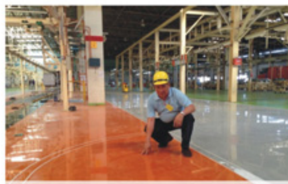
KONCREFLEX SL Self-Leveling Epoxy System

Polyurethane (PU) and Epoxy Flooring Systems