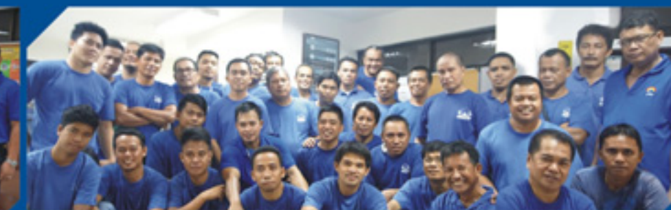
Warehouse and Delivery | Machine Shop