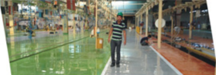
Flooring System for an Electronics Device Manufacturing Facility