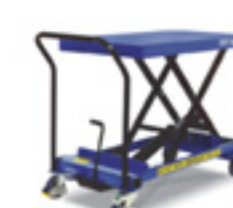
Hand Pallet Trucks