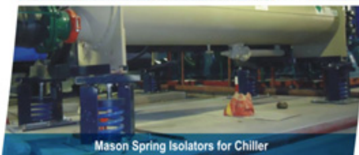
Mason Spring Isolators for Chiller