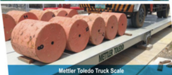
Mettler Toledo Truck Scale