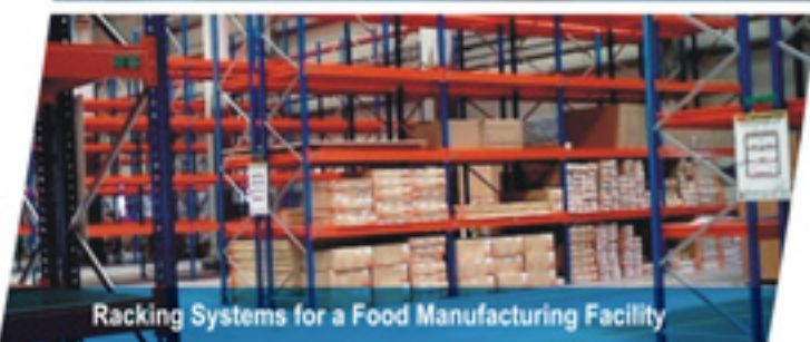
Racking Systems for a Food Manufacturing Facility