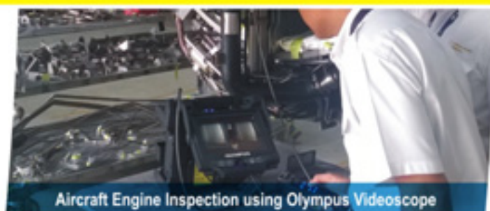
Aircraft Engine Inspection using Olympus Videoscope

Kindly fax or email us your complete list of requirements and note the due date for quotation submission. An account officer will be assigned to service all your needs.